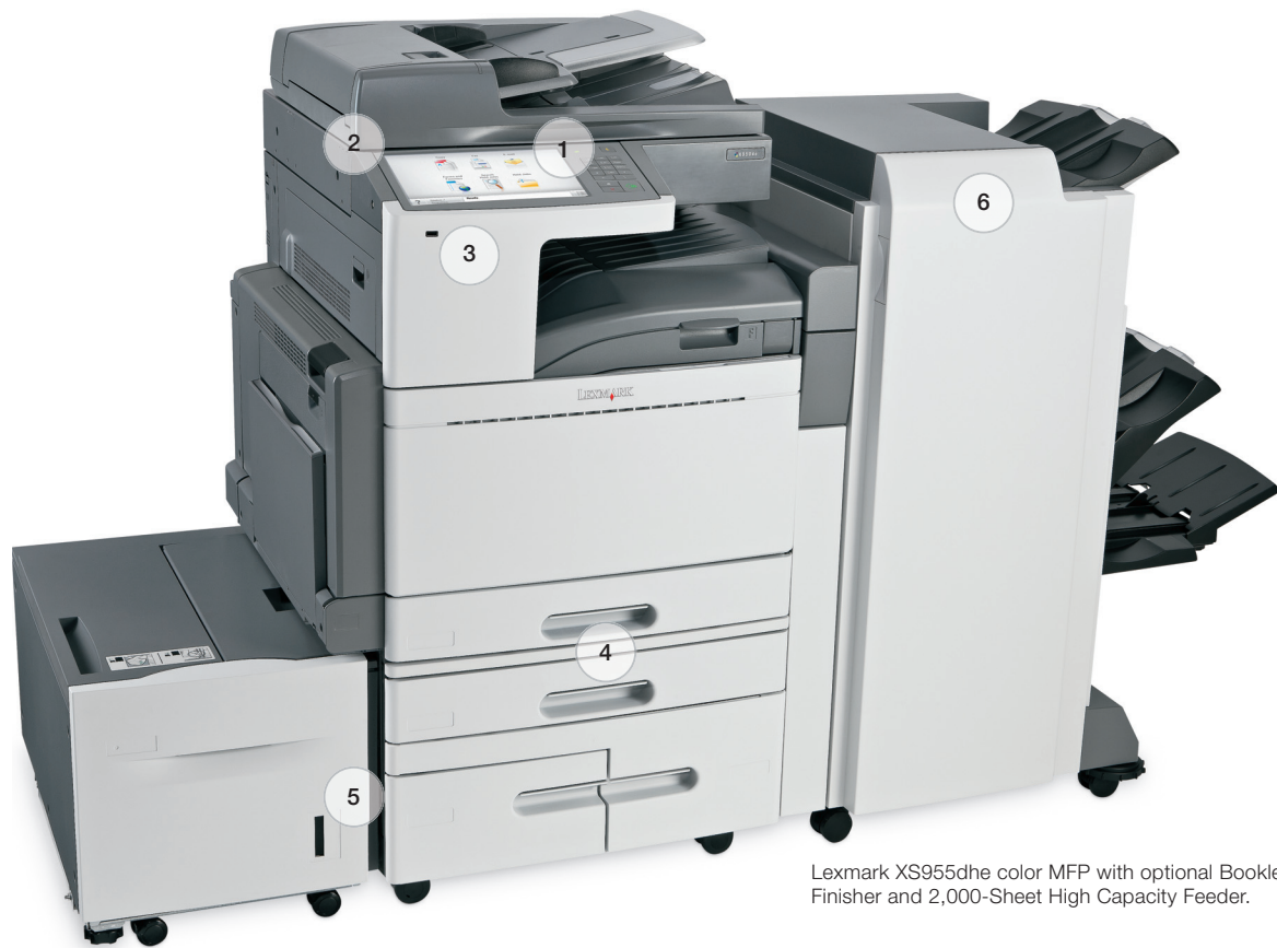
Lexmark XS955dhe color MFP with optional Booklet Finisher and 2,000-Sheet High Capacity Feeder.